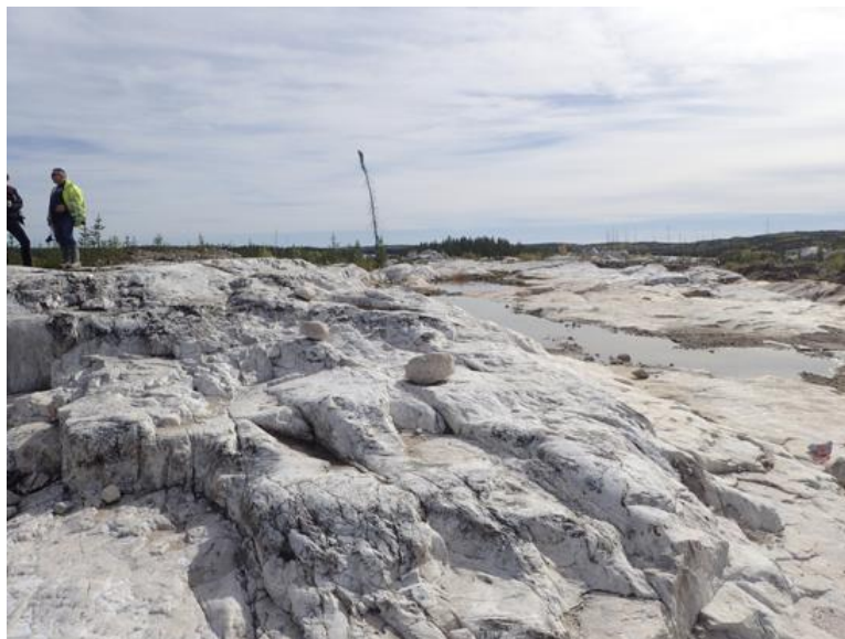
Figure 2: Surficial Exposure of PAK deposit

The Company has been actively involved since February 2013 in the exploration and development of the PAK Lithium Project, which hosts at surface one of the highest quality spodumene lithium hard rock deposit in North America (Figure 2) at the PAK deposit. The PAK and Spark deposits combined are among the highest-grade resources with the lowest iron impurity levels in North America (e.g. iron levels less than 0.15% Fe 2 O 3 in the lattice of the spodumene crystals).